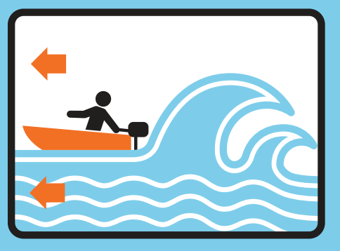
If you are on a boat, head to deep waters (higher than 100 metres deep)