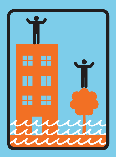
Go to an upper floor (more than third) of a solid building As a last resort, climb up a strong tree