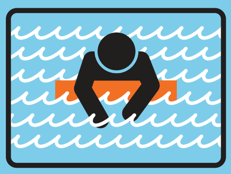
If swept-up, grab something that floats