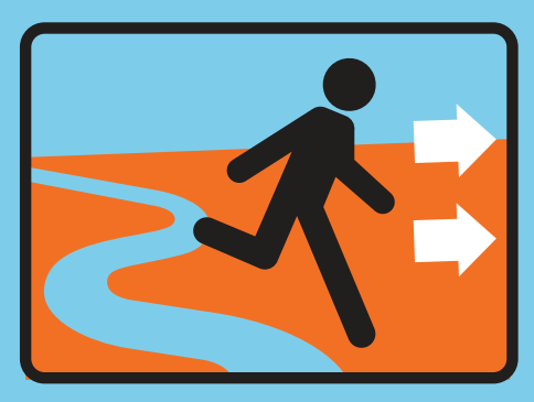
Stay away from rivers and estuaries Tsunamis can travel up rivers!