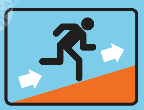
Head for high ground and inland

Indentify evacuation routes and safe places closer than 15 minutes walk Roads and bridges can be damaged!