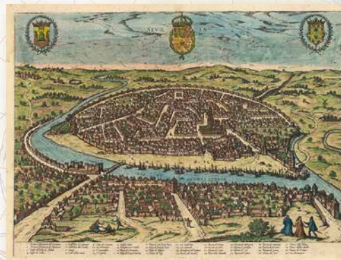
View of Seville (1588)

T his exhibition takes visitors on a cartographic journey through the most interesting aspects of the voyage: its background, preparations, course, and consequences. Starting with the geographical concepts of the ancients, we will explore the unexpected discovery of the American continent, the Treaty of Tordesillas by which Spain and Portugal divided up the world, the cartographic espionage between the two, the spice trade as the true objective of the expedition, and the first maps of the Strait of Magellan and the Moluccas, all set against the backdrop of 16th-century Spain.