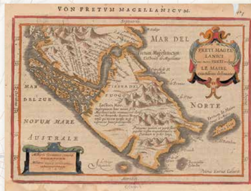
Map of the Strait of Magellan (1640)

A mong the items on display are original atlas, maps and views of cities from that era, as well as highly accurate facsimile reproductions of nautical charts, maps, globes, and historical documents related to the expedition, all of which are of great interest in commemorating such an incredible feat.